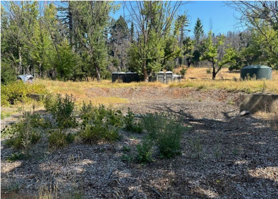
Photo 8 Footprint of Residence 8, view south