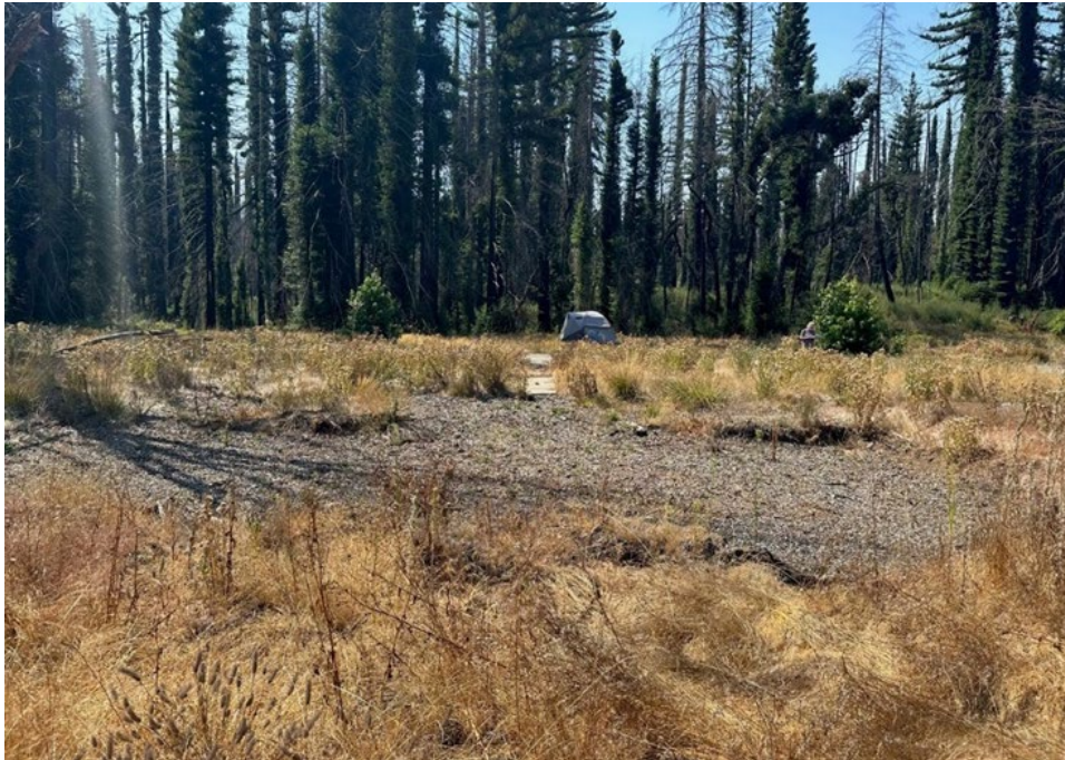
Photo 23 Footprint for Residence 14, view south