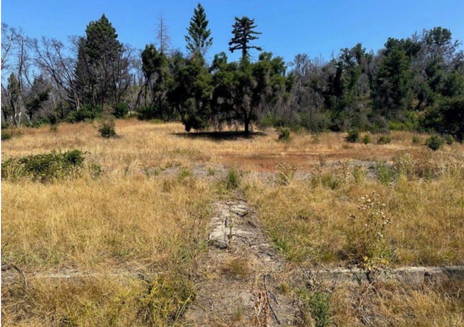
Photo 14 Footprint of Residence 16, view north