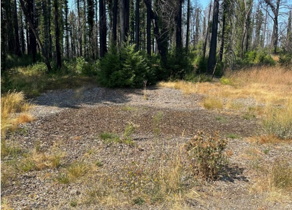
Photo 12 Footprint of Garage 7, view north northeast