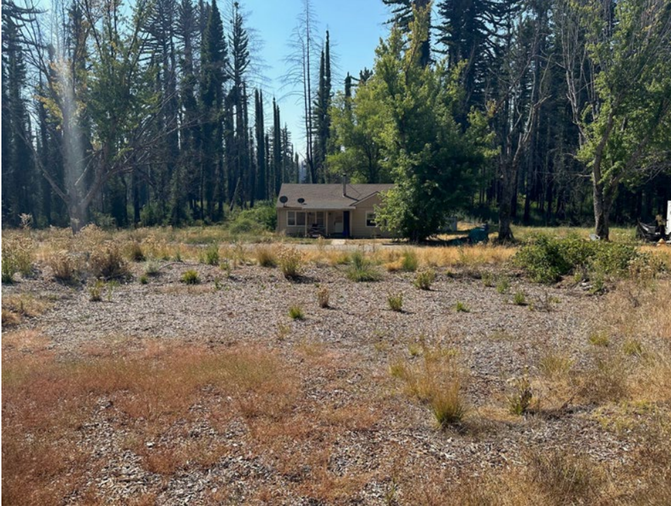
Photo 2 Footprint of Residence 9, view north