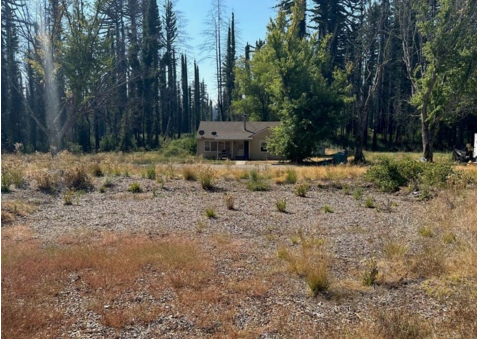
Photo 16 Footprint of Garage 14-16, view north