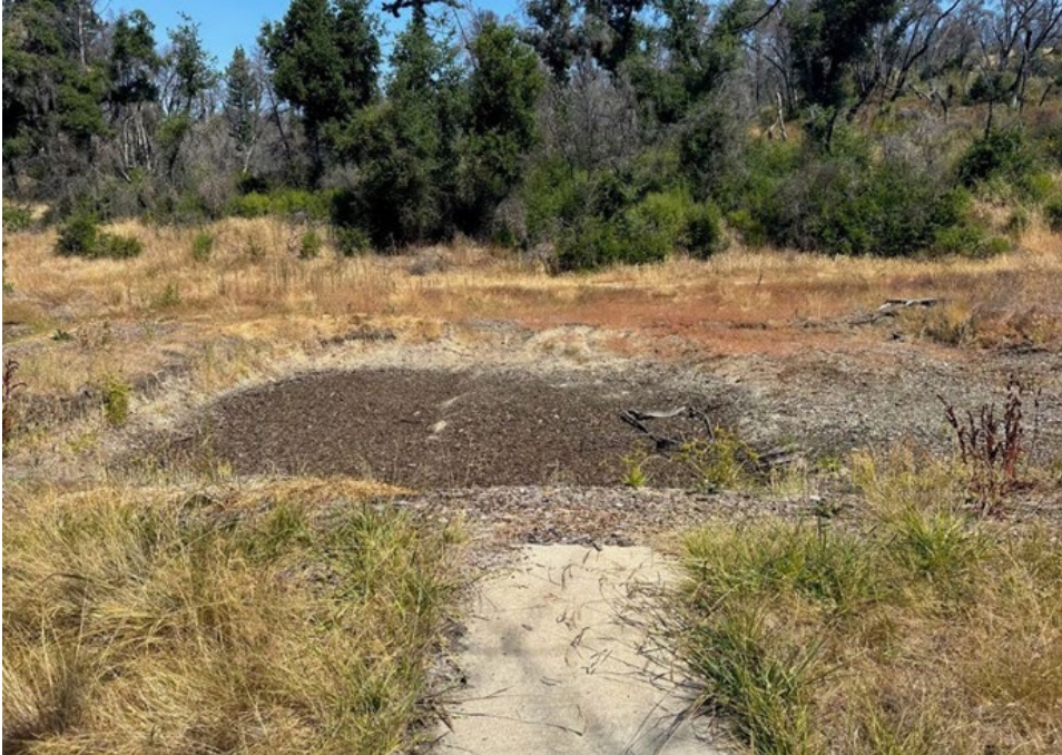
Photo 20 Footprint of Residence 15, view south