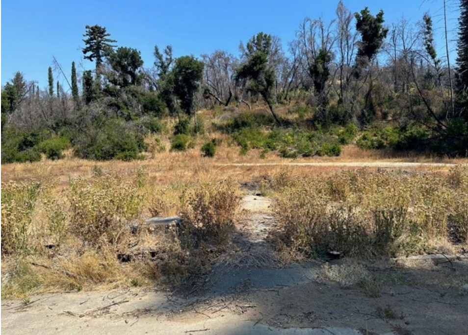
Photo 22 Footprint for Residence 14, view north