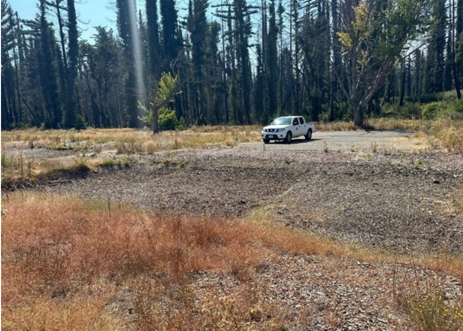
Photo 18 Walkway for Residence 15, view north