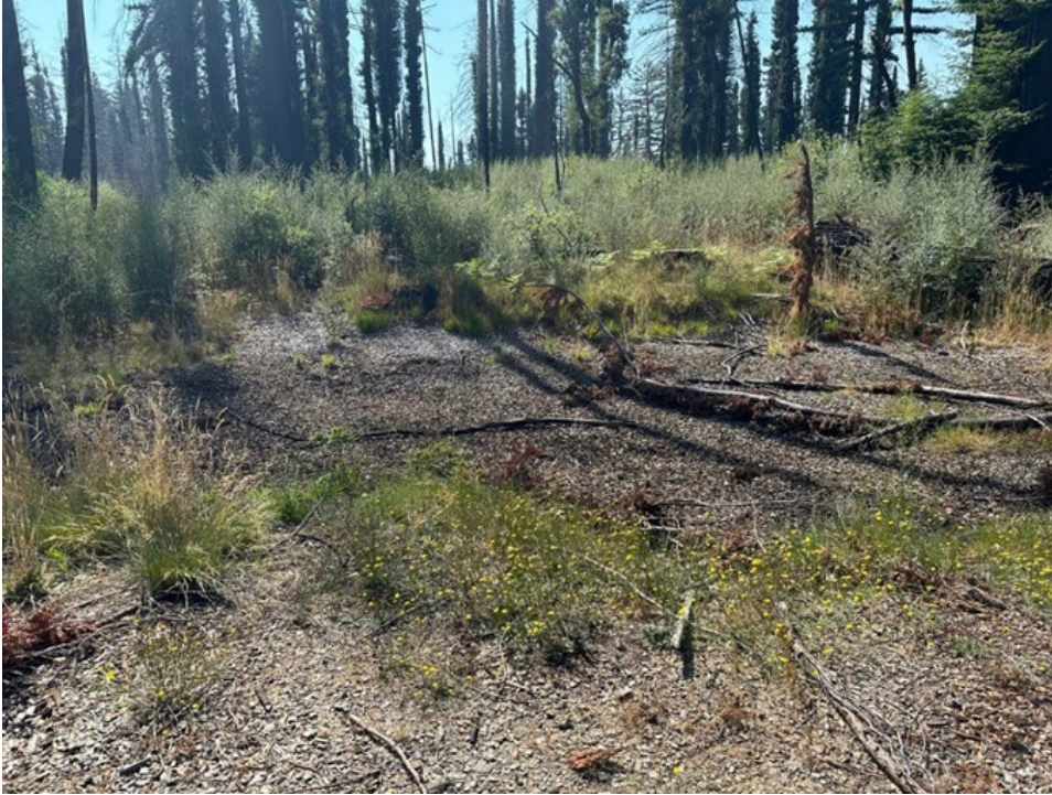
Photo 6 Footprint of Garage 8-10, view northwest