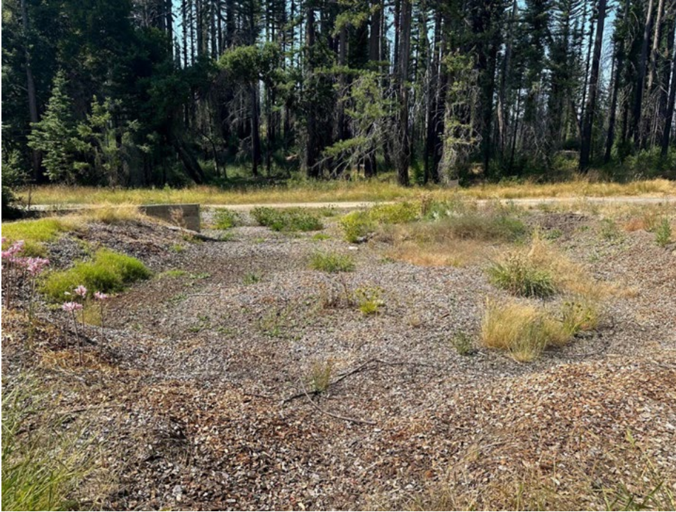
Photo 10 Footprint of Residence 7, view north