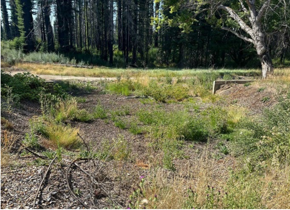
Photo 4 Footprint of Residence 9, view southeast